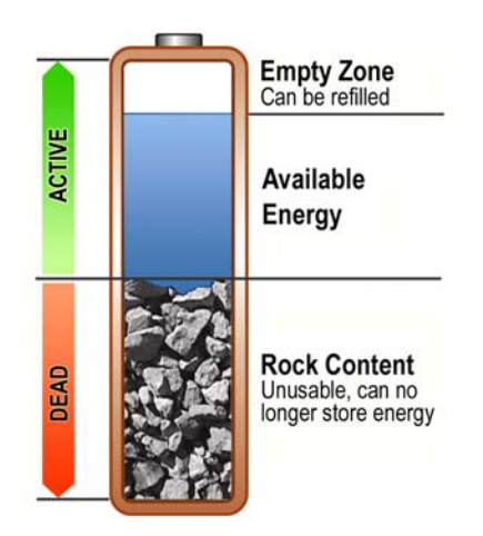
Figure 2: Aging battery. Batteries begin fading from the time they are manufactured. Very few produce 100% capacity.

Most organizations follow strict maintenance and calibration procedures on machinery as part of QA but the battery is often forgotten. Yet the energy source is a key element that must be given proper attention. In essence, checking battery performance will be more important than fulfilling regulatory disciplines for the sake of satisfying mandatory requirements.