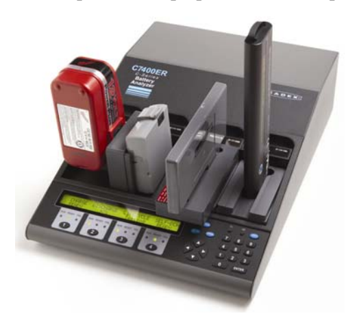
Figure 3: Cadex C7400 battery analyzer

How can the state-of-health of a battery be measured? The best tool is a battery analyzer. Over the past years, these analyzers have gained critical inroads into industries such as radio communications, medical and portable computing. Figure 3 shows a Cadex C7000 Series battery analyzer that can be configured to service packs for laptops, scanner, cell phone and other portable devices.